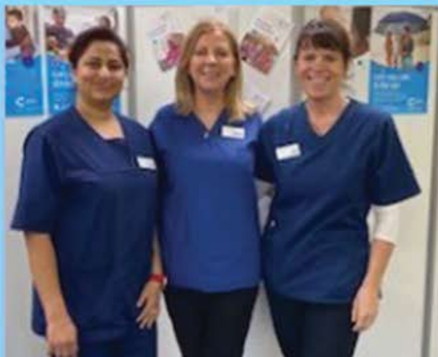
Our Community Health Advisors

We are a small team working with Sale Moor Community Partnership (SMCP), Our Sale West (OSW) and Sale Central Primary Care Network (SCPCN).