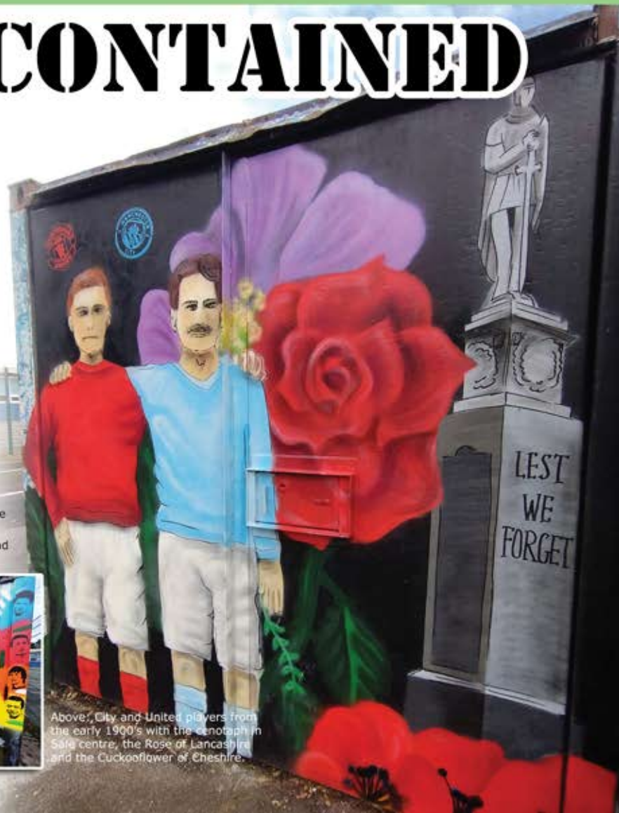
Above: City and United players from the early 1900's with the cenotaph in Sale centre, the Rose of Lancashire and the Cuckooflower of Cheshire.